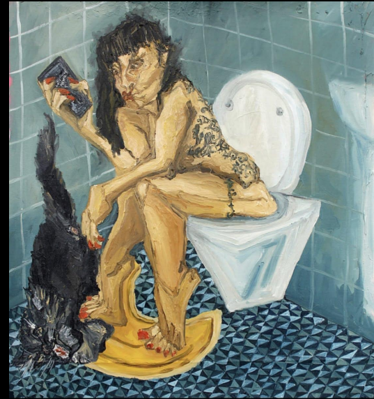
Toilet talk, self portrait, 2023