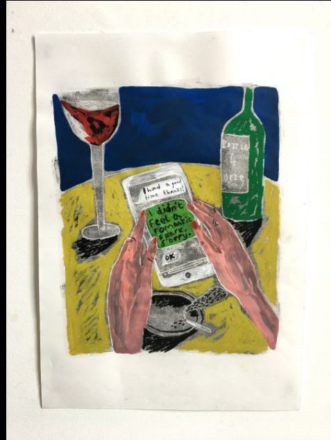
Bottle 4-1, 2022 SOLD Unique (1/1) Monotype w mixed media Size Includes Frame: 49.5 x 68.5