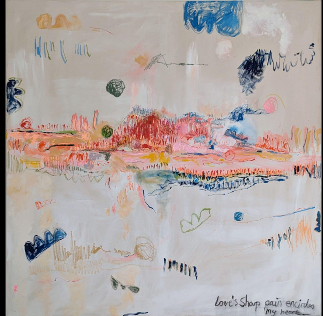
Love's Sharp Pain Encircles My Heart, 2023 Oil, soft pastels, acrylic on canvas 170 x 165 cm