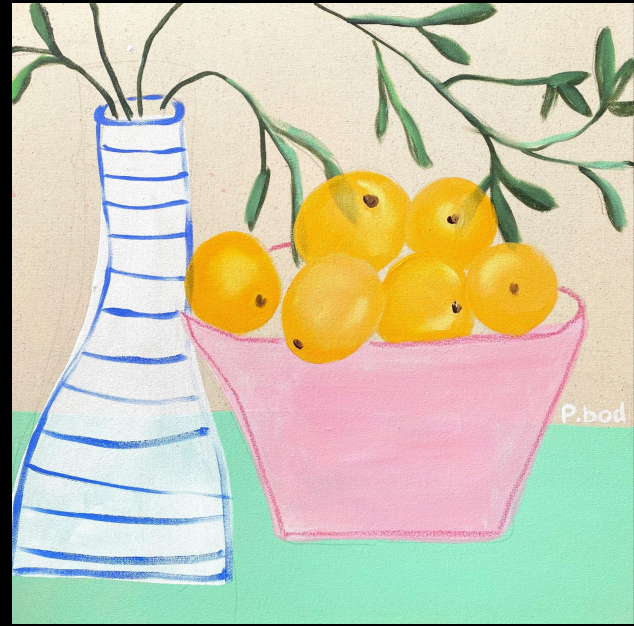
Oranges in pink, 2023 Acrylic & oil stick on canvas 50 x 50 cm