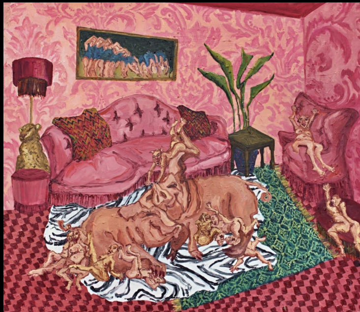
Babe magnet, 2022