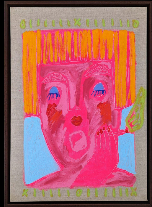
Coming back for more, 2023

Painting (mixed media on linen canvas) 49.5 x 69.5 cm