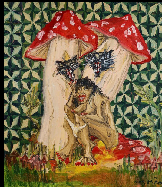
Naughty Pu$$y, 2023 Oil on canvas 35 x 30 cm