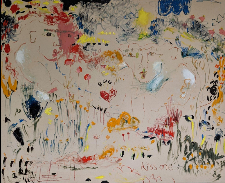
Kiss Me, 2023 Oil on canvas 168 x 137 cm