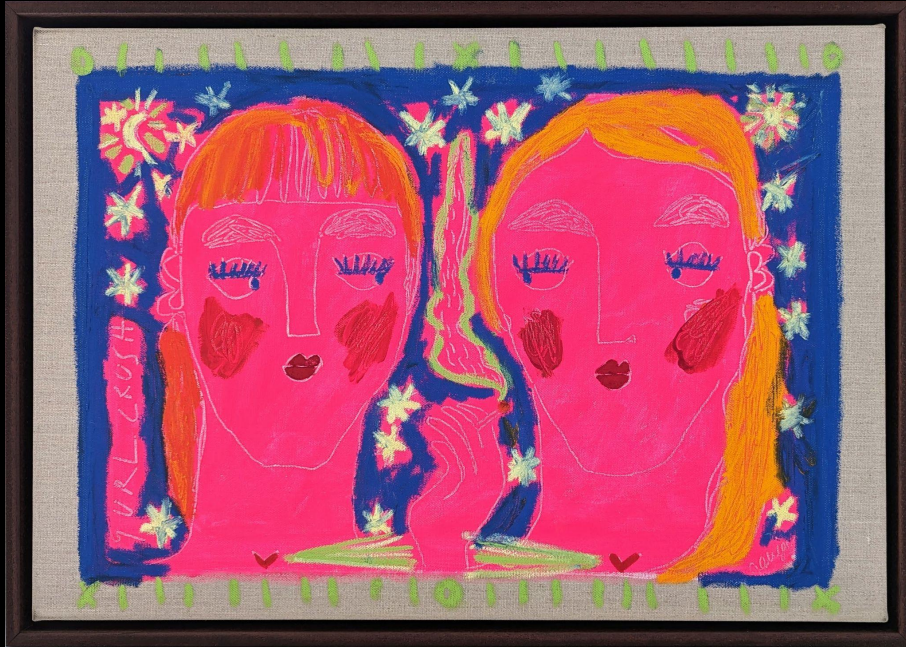
Gurl Crush, 2023

Painting (mixed media on linen canvas) 69 x 49.5 cm