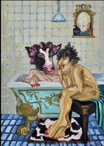
Dirty cow, 2023