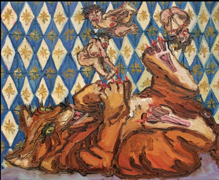
Catlady 2.0, 2023 Oil on canvas 30 x 25 cm