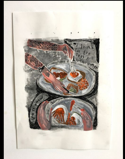
First Dates, 2022 SOLD Unique (1/1) Monotype w mixed media Size Includes Frame: 46.5 x 66 cm