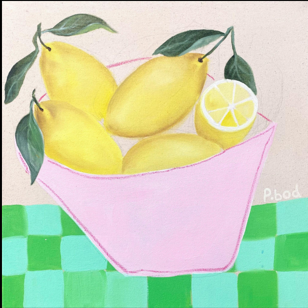
Lemons in pink , 2023 Acrylic & oil stick on canvas 50 x 50 cm