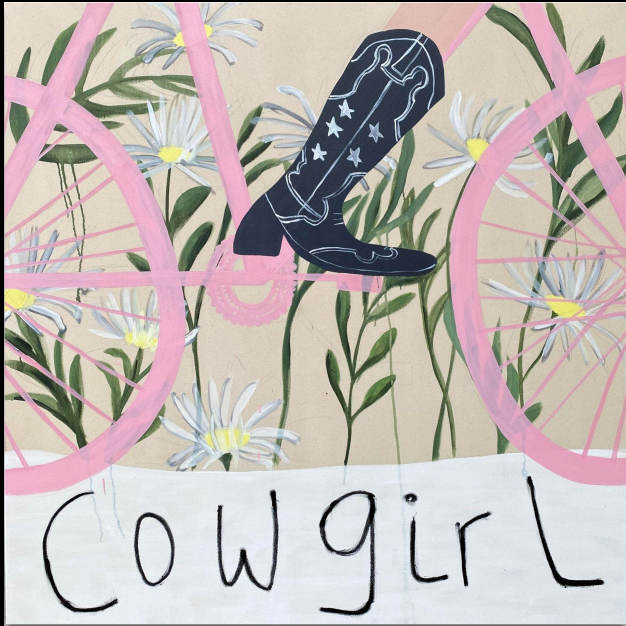
Cowgirl, 2023 Acrylic & oil stick on canvas 140 X 140 cm